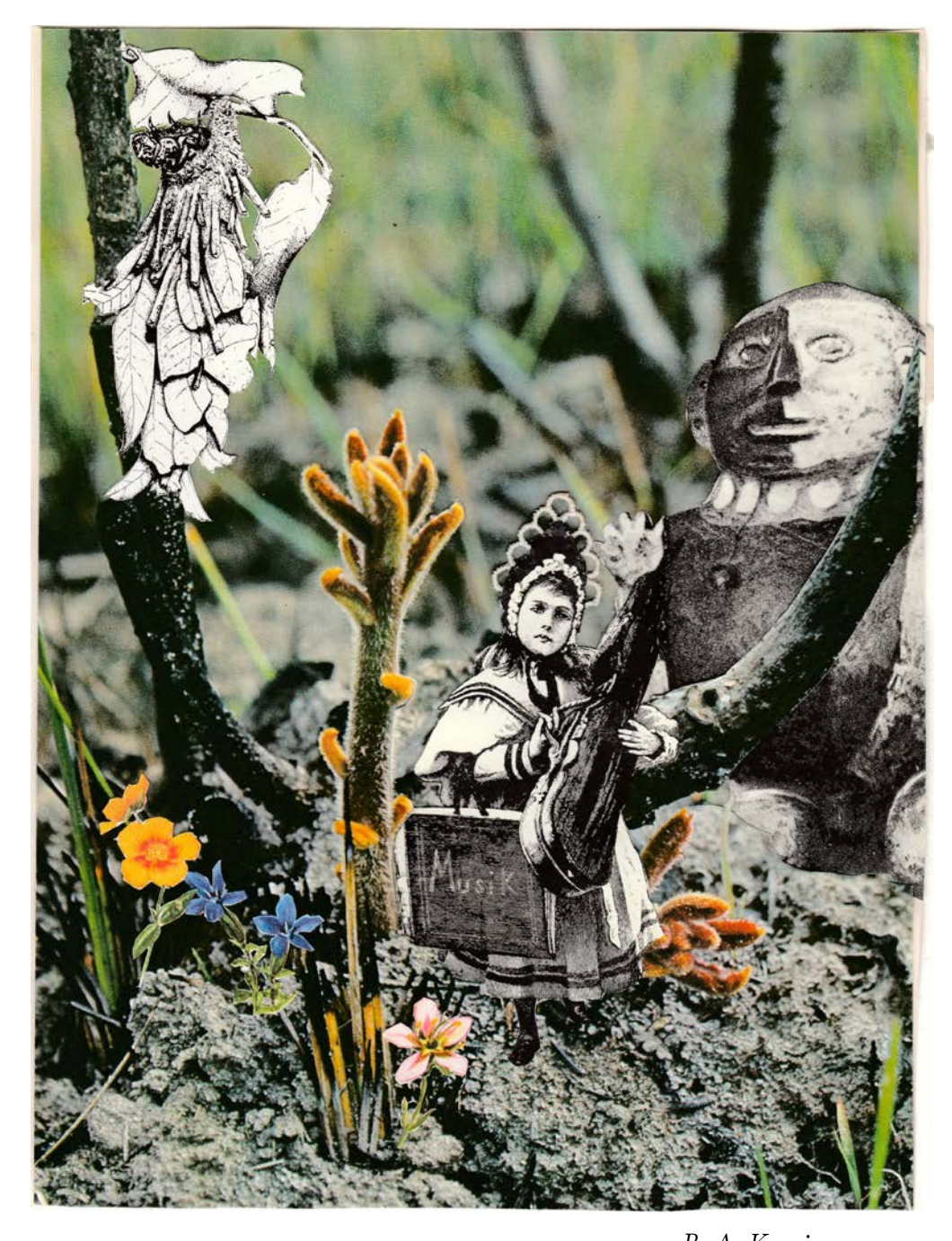
B. A. Kocsis Empire of Innocence No.2

The child I was is still drowning in it. The loon gone, absolutely gone. Its hollow cry marks where it was.